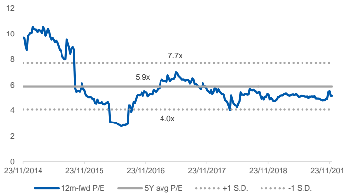
Figure 4: RCE's 12-month forward P/E