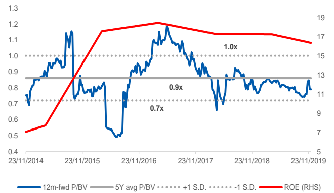
Figure 5: RCE's 12-month forward P/BV